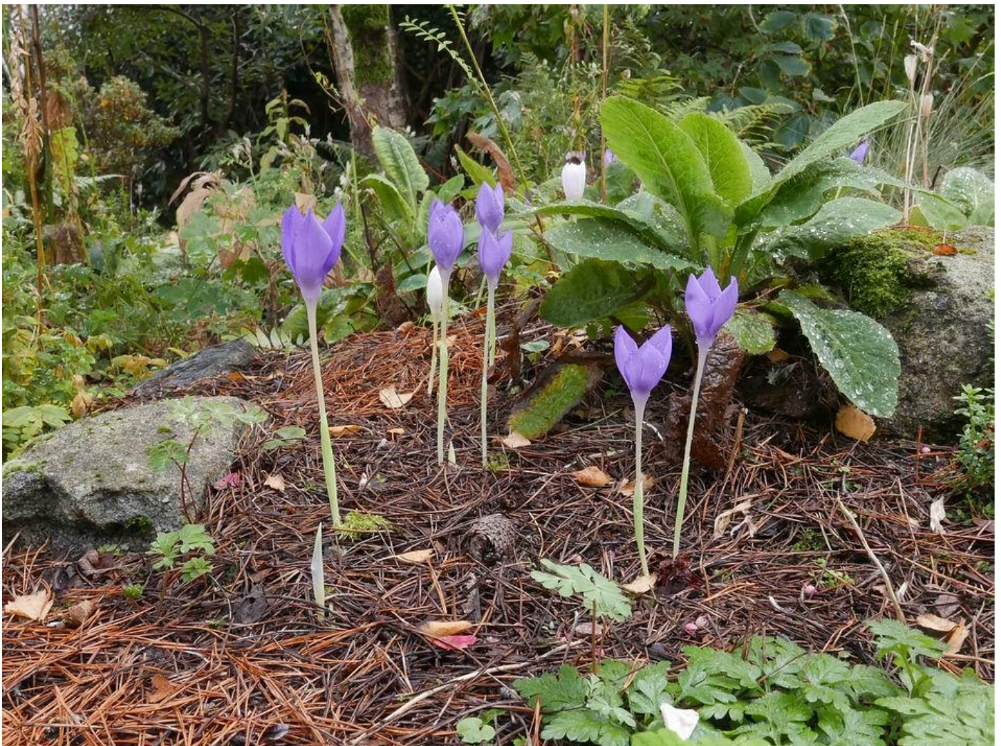
Crocus banaticus is superficially similar in appearance/ colour to Crocus nudiflorus but very different when it is mild enough for the flowers to open, revealing the short inner three segments.