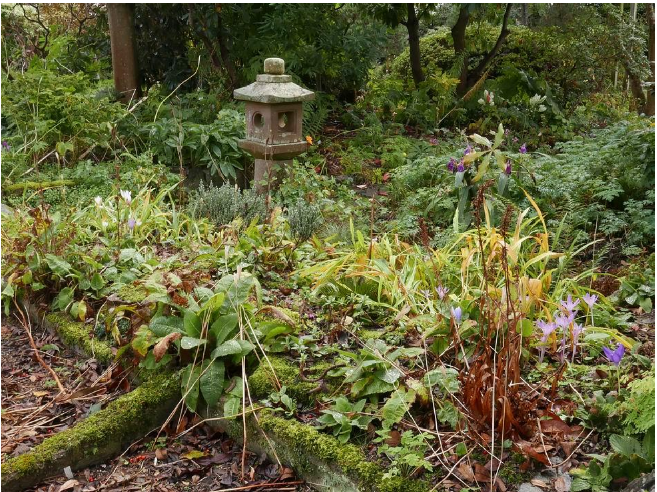
Another typical autumnal scene showing the colourful chaos that autumn bring to the garden – note the crocus and colchicum flowers appearing through the yellowing foliage.