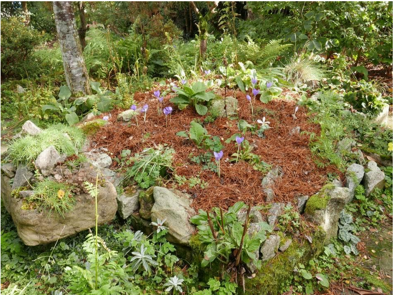
I like the fresh pine needle mulch; it gives both a very natural looking mulch plus to my eye the red /brown gives a pleasing colour contrast with the crocus flowers.