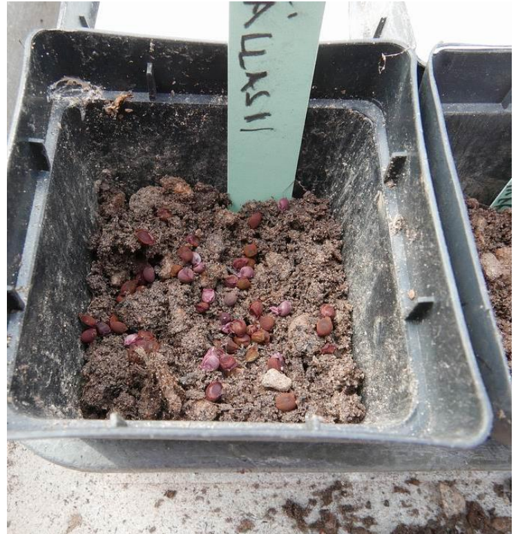
Crocus seed sown deep.

The Crocus seeds are among those that I sow deeply with great success – sowing deeply means that the young corms do not have to make their own way down, allowing them to grow better, especially in the first and second year.