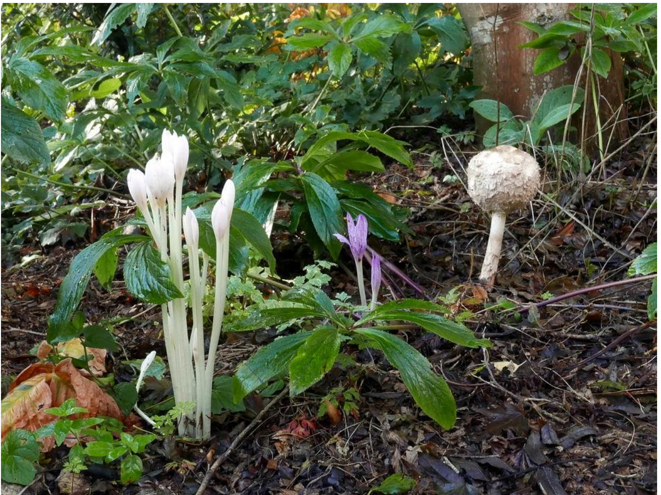
I will round off this week with two images taken one day apart of Colchicum flowers and a fungi.