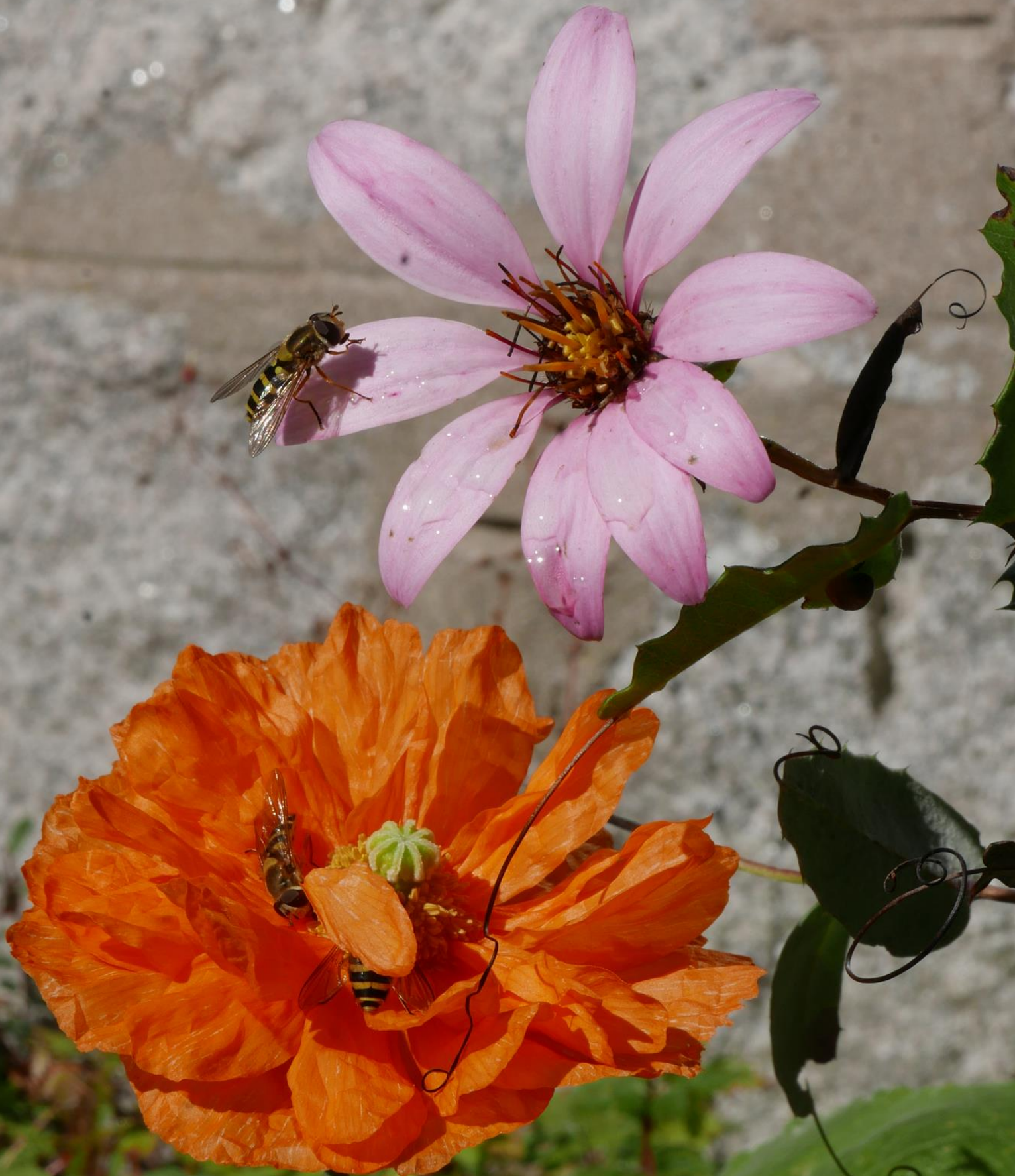
Papaver rupifragum and Mutisia spinosa